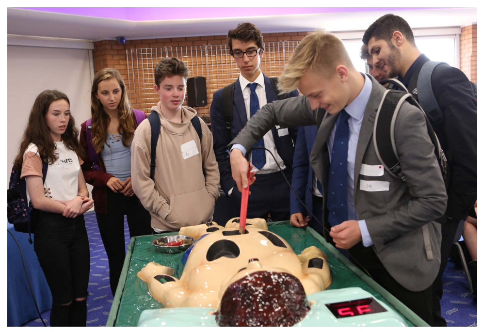
School pupils getting 'hands on' at a BMA event