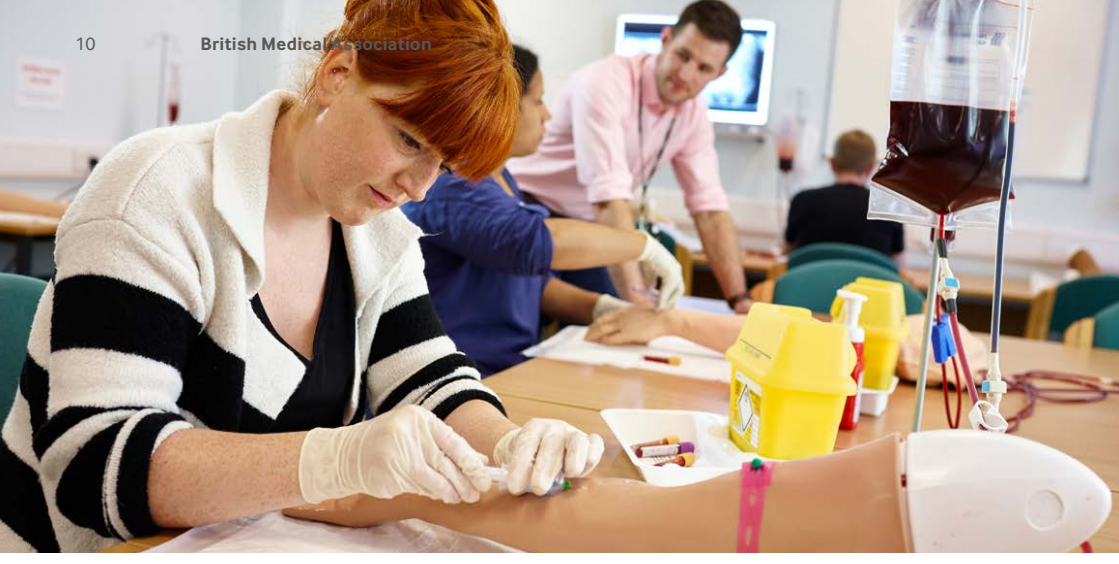
Photo of a Swansea University Medical School student practising taking blood in the skills lab