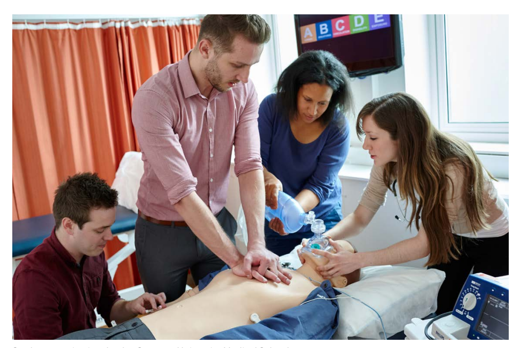
Students getting involved at Swansea University Medical School