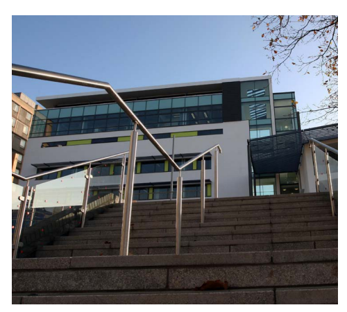
Cardiff University's Cochrane Building, which houses medical education