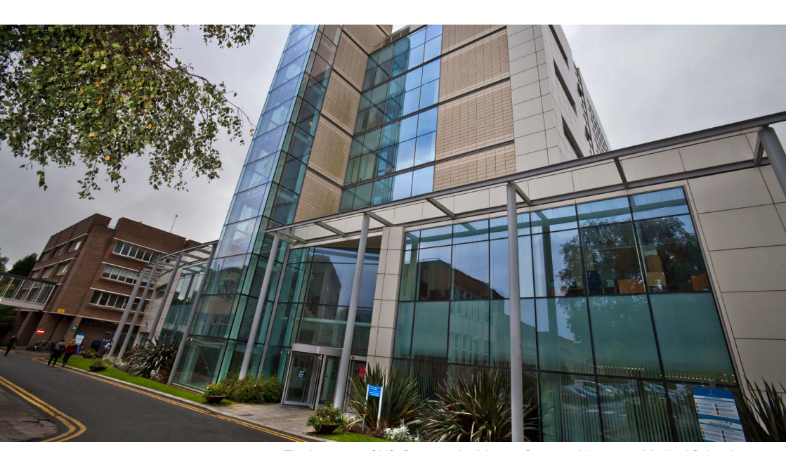
The Institute of Life Sciences building at Swansea University Medical School

Your options are much the same as above.